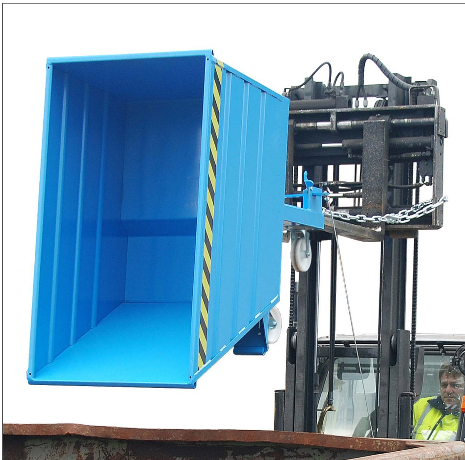
Type VG with castors