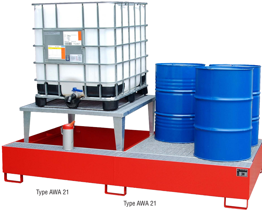
Type AWA 21