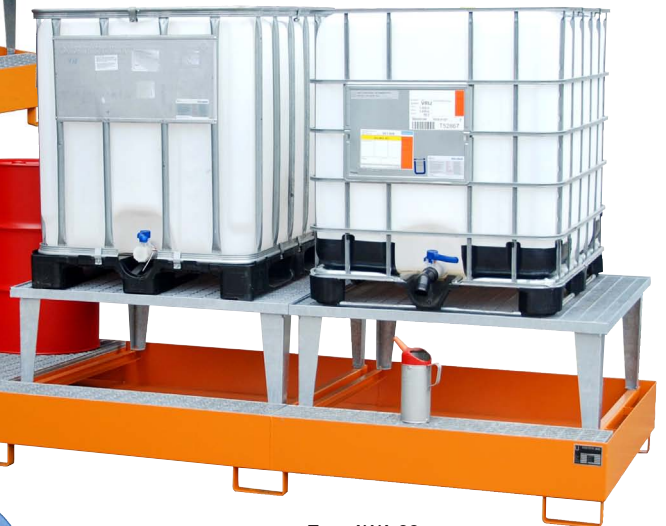
Type AWA 32