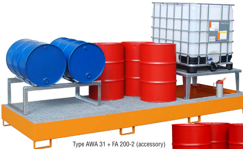
Type AWA 31 + FA 200-2 (accessory)