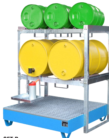
SET D: Type 2032 + FRE-2/M + GS + FRE-3/M