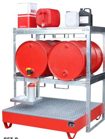
SET C: Type 2032 + FRE-2/M + GS + FRE-G2/M