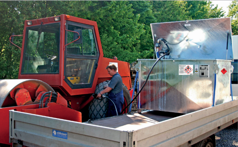
MT 1000 with electric pump

Mobile diesel and fuel oil supply for building site vehicles, machinery, equipment. For the international transport of hazardous liquids according to ADR/RID and the IMDG code, packing groups II and III