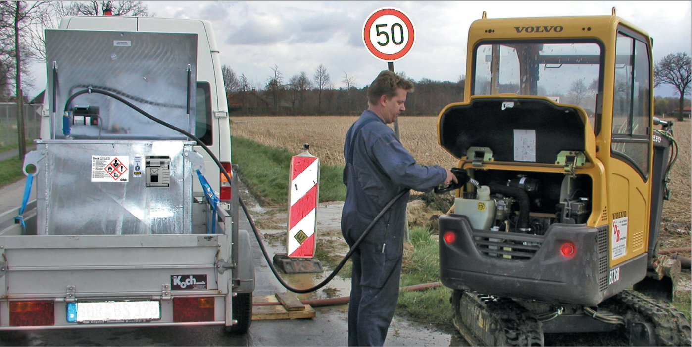
MT 450 with electric pump