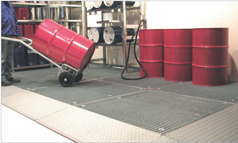
8 x BSW + 6 x AR + 1 x AE + 3 x KV + 10 x WV (accessories: Drum Trolley type FP-V, Drum Shelves type FR)

Ground protection spill trays for storage and filling; can be driven on