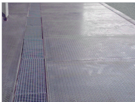
Drain channel with grate

Painted finish according to your choice from the RAL colour code chart