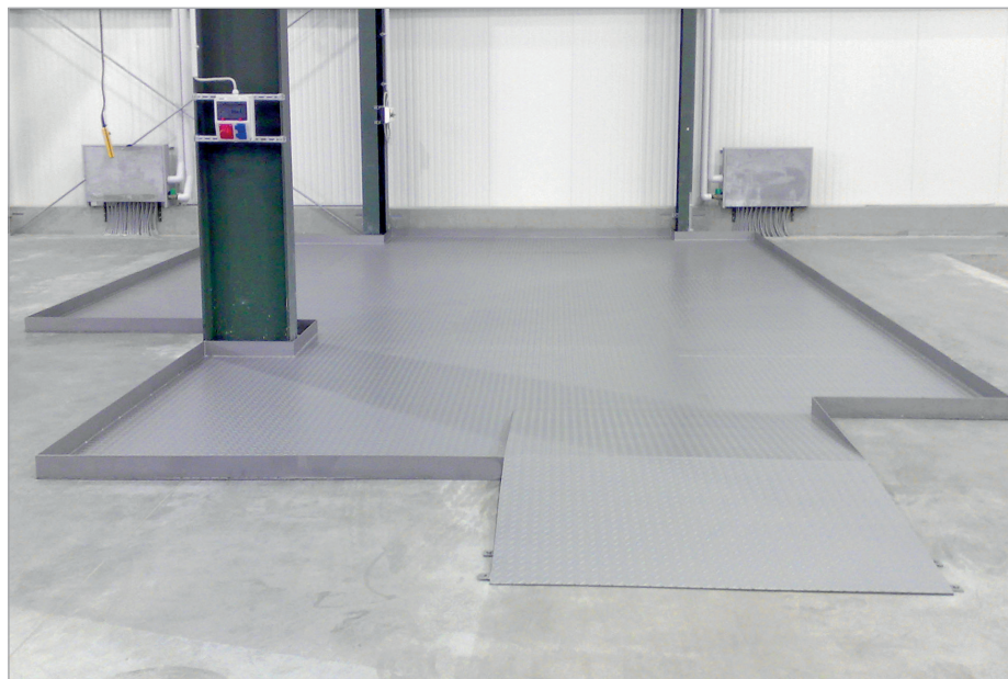
Ground protection floor elements with a recess for a column and with a threshold ramp

German legislation (VAwS and WHG) stipulates that facilities that handle waterpolluting substances i.e. loading or unloading operations etc. must be equipped with adequate containment protection. Ground Protection Floor Elements fulfil these requirements and also help prevent mechanical damage to the floor.