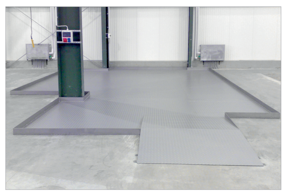
Ground protection floor elements with a recess for a column and with a threshold ramp