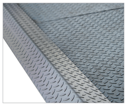
Folded threshold, can be driven on