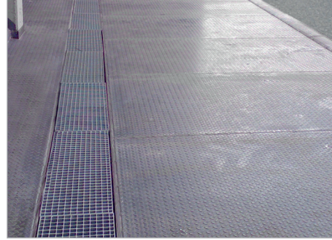
Drain channel with grate

German legislation (VAwS and WHG) stipulates that facilities that handle waterpolluting substances i.e. loading or unloading operations etc. must be equipped with adequate containment protection. Ground Protection Floor Elements fulfil these requirements and also help prevent mechanical damage to the floor.