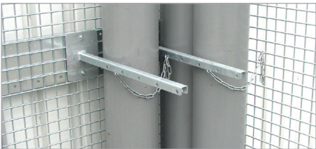
Fixture with safety chain