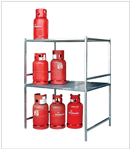
2x type GFG, stacked