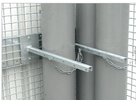
Fixture with safety chain