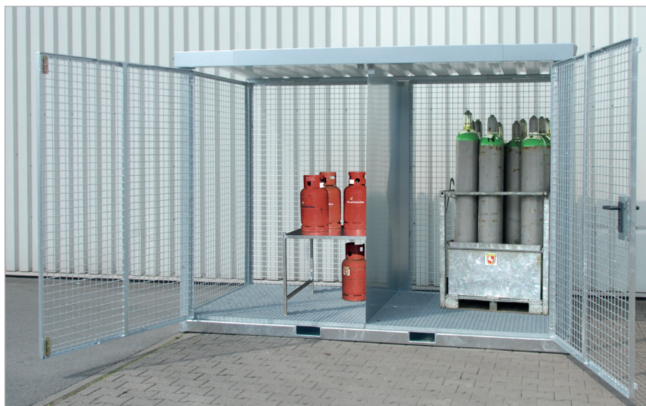
GFC-E/G M4 with dividing wall (accessories)