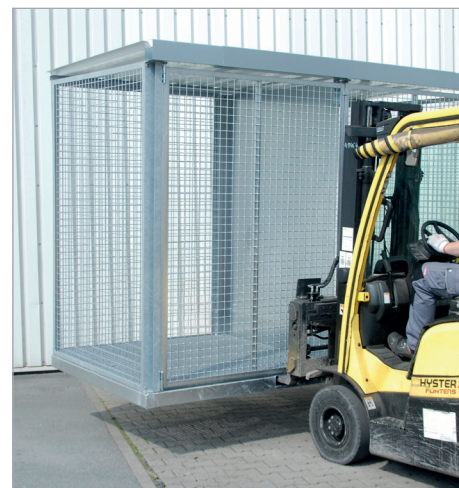
GFC-E/G M4 with dividing wall (accessories)