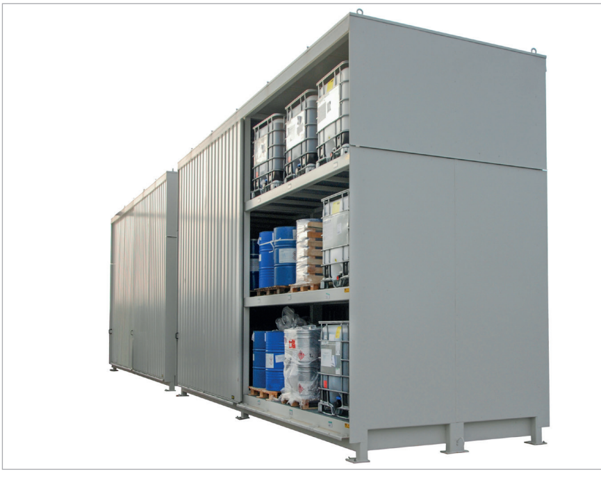
2 storage levels, access from two sides

Shelf Containers are also available in other sizes and a variety of RAL colours. Individual project engineering on request. Please contact us - we'll be glad to help.