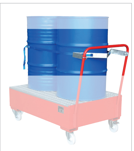
Tension Belt for 2x200 litre drums