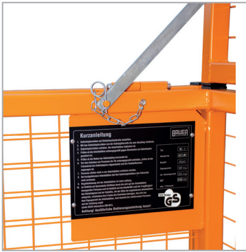
Safety chain to secure folding mesh back screens Short instruction