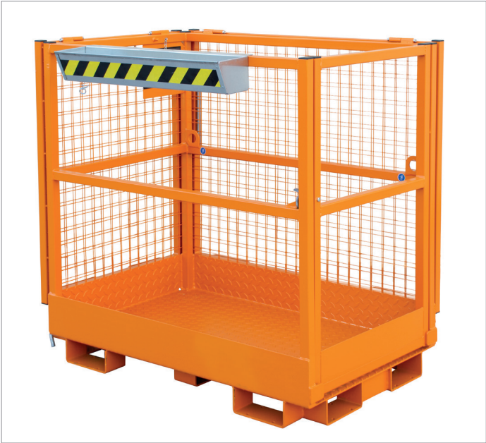
Folding mesh back screens help save storage space