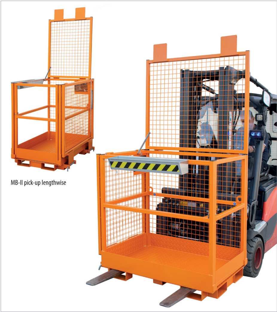
MB-II pick-up lengthwise