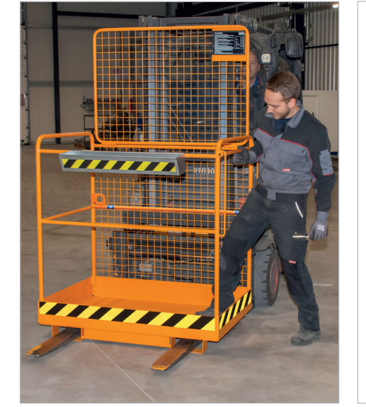
Enter via self-closing saftey bar