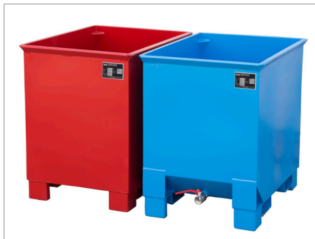
C 30 and CS 30