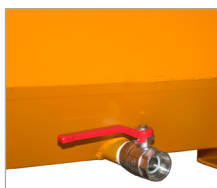
1" drain cock (CS)