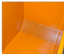
Perforated sieve (CS)