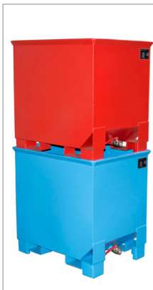
CS 30 stacked