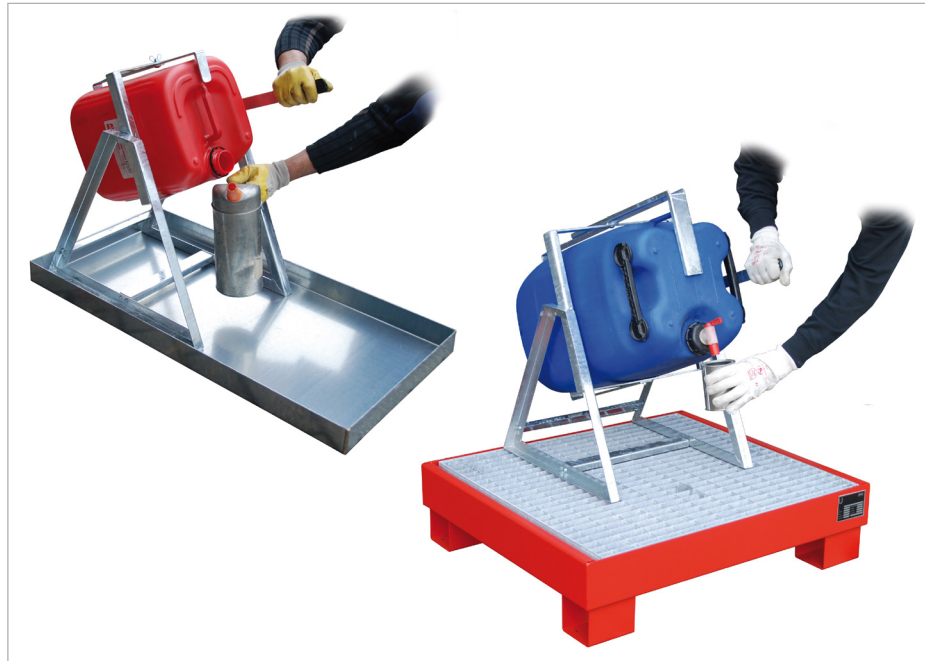
KAH-25 with Spill Tray for Small Cans KGW-2