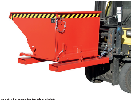
3S, ready to empty to the right