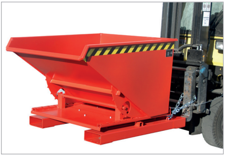
3S, ready to empty forwards