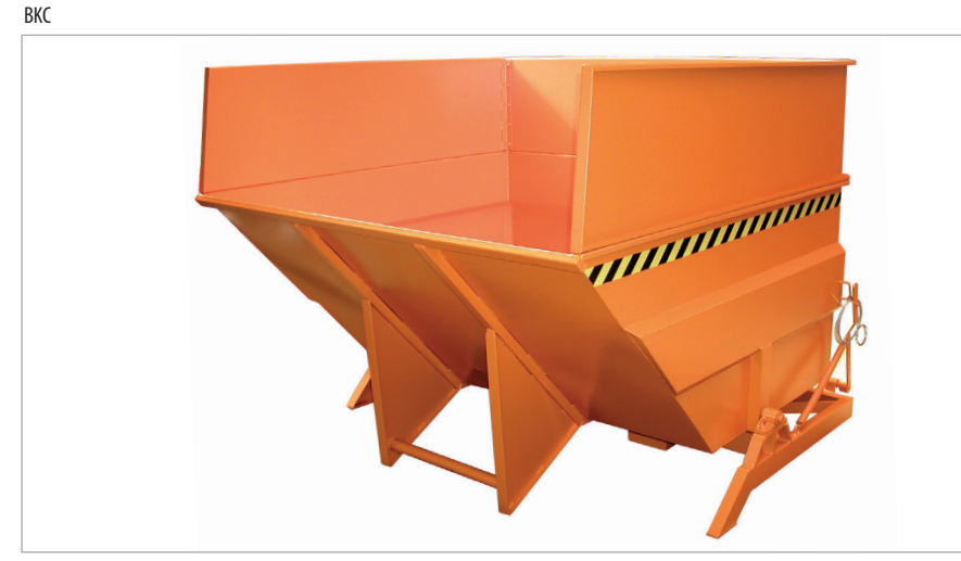
BKC with extender frame