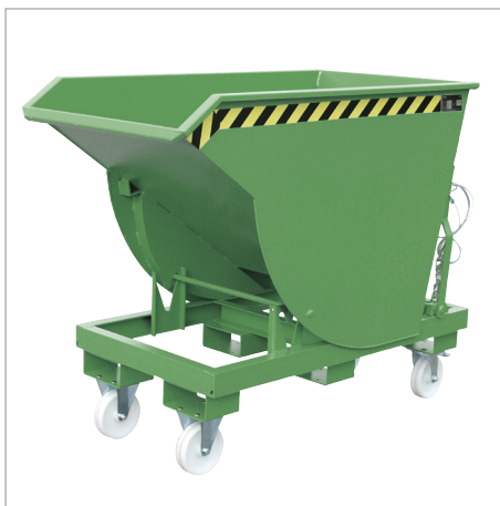
BKM with castors