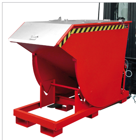
BKM with lid