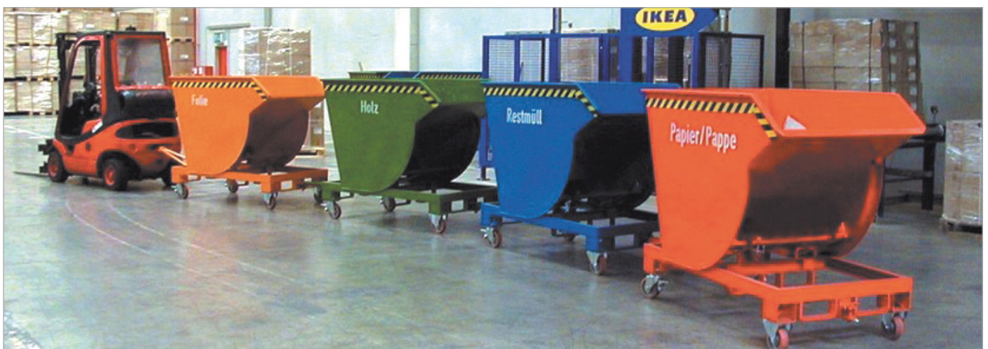
BKM with castors, trailer coupling and towing bar