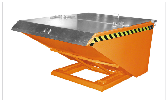
NK with lid