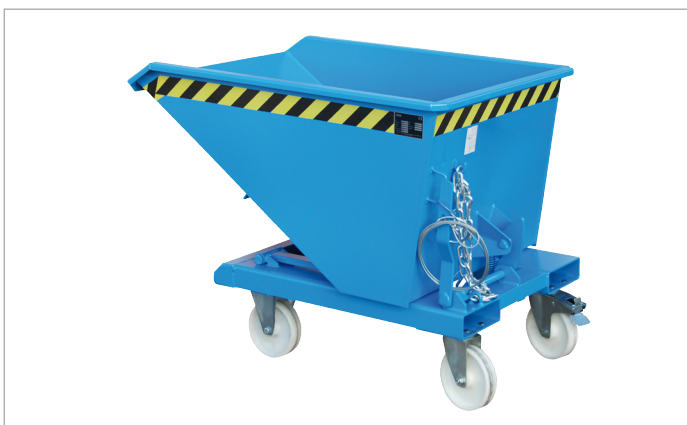
NK with castors