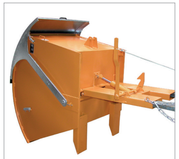
RD with adjustable dumping brake