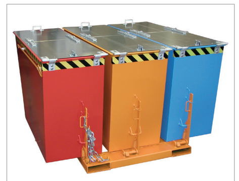
TRIO with lid