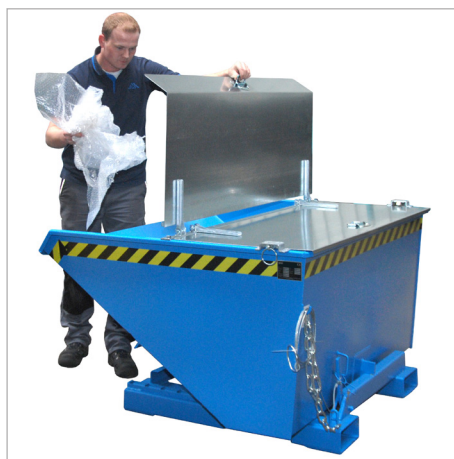
EXPO with lid