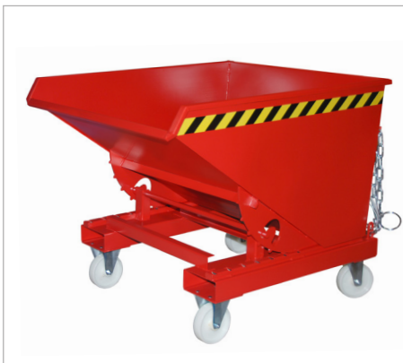
EXPO with castors