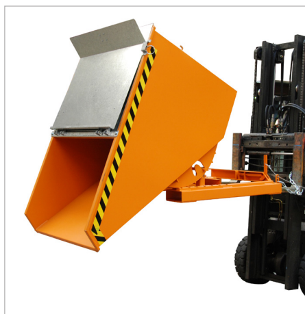
EXPO with lid