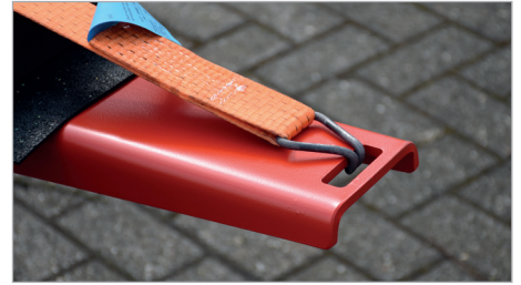
Securely held . . .