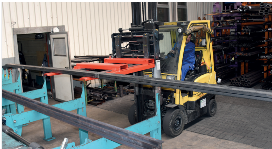
Picking up long material