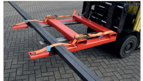
Position: load at the front for loading and unloading