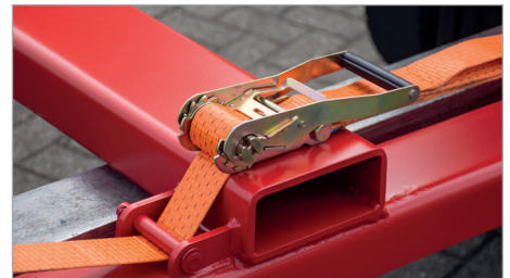
...by lashing straps