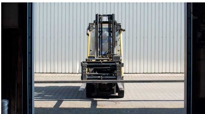
You can't pass through a gate with long material unless you have an LSL!