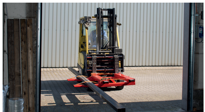
Use the LSL for long material and easily pass through gates or navigate narrow aisles