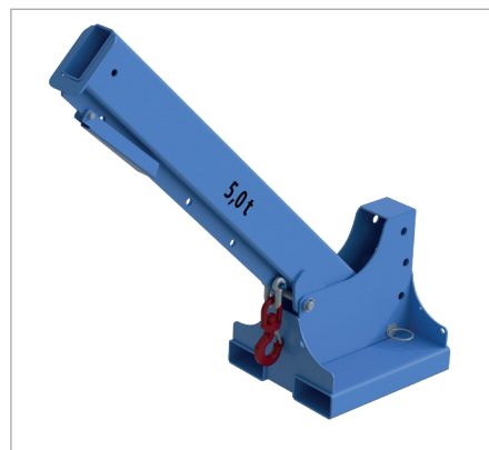
KTH-K at an elevated working height