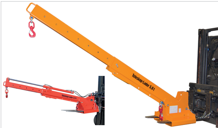
Hydraulic extension function (KTH) (accessories)