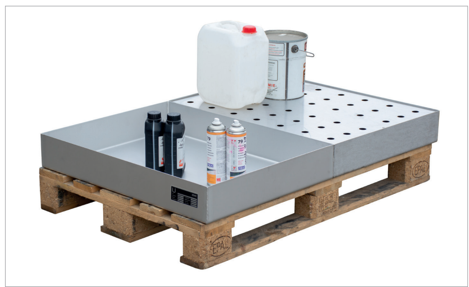
On a Euro pallet 1200x800 mm: KGW-P 2 V4A and KGW-P 2/M V4A