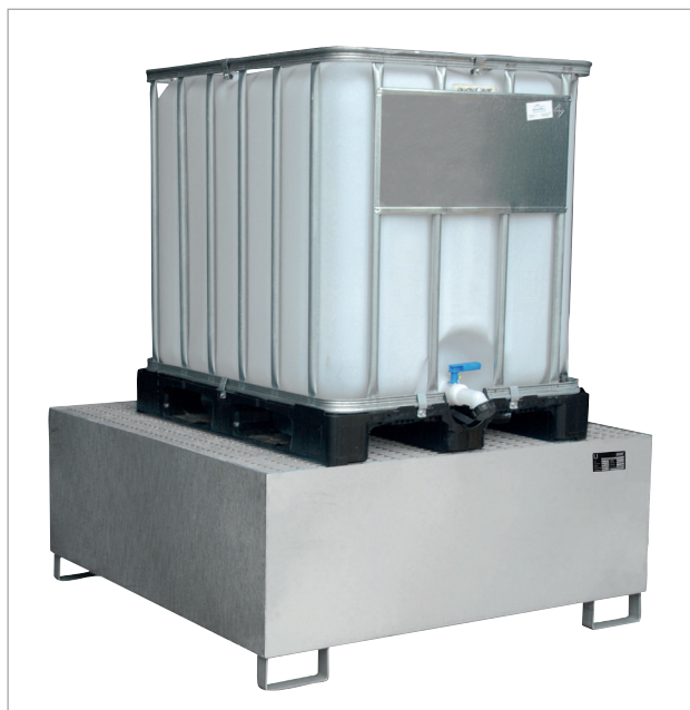
VAW-1000 with grid (accessories)