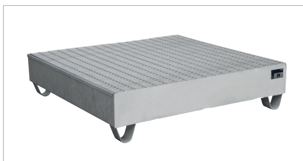
VAW-4/A with grid (accessories)