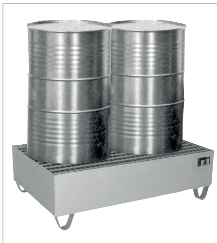
VAW-2 with grid (accessories)

Storage of max. 4 x 200 litre drums or 2 x 1000 litre containers (IBCs) containing aggressive substances or 200 l drums or an IBC in combination with 60 litre drums and/or canisters and small cans