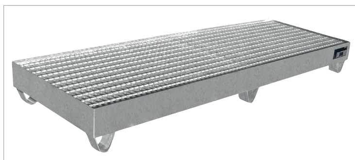
VAW-4/B with grid (accessories)