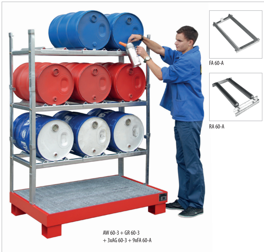
AW 60-3 + GR 60-3 + 3xAG 60-3 + 9xFA 60-A