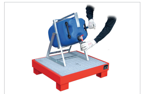
Tilting Canister Stand KAH 60 with Sump Tray AW 60-2/M