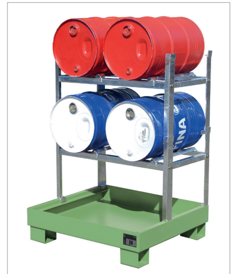
AW 60-2 + 2xAG 60-2 + 4xFA 60-A