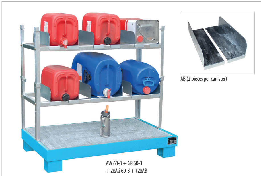
AW 60-3 + GR 60-3 + 2xAG 60-3 + 12xAB