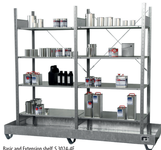
Basic and Extension shelf S 3024-4E