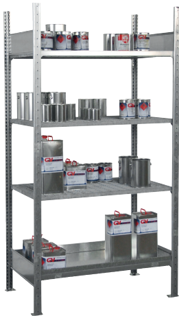
Basic shelf S 3017-4E