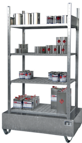
Basic shelf S 3021-4E