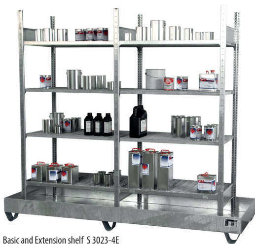
Basic and Extension shelf S 3023-4E