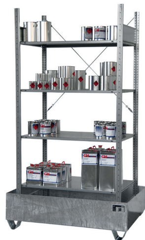
Basic shelf S 3022-4E