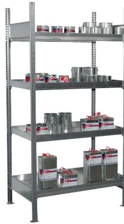
Basic shelf S 3019-4E