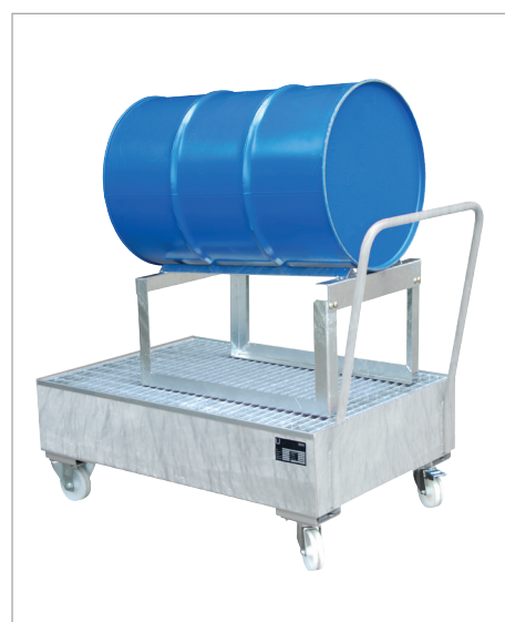
S 2021 with Drum Support type FA 200 (accessories)