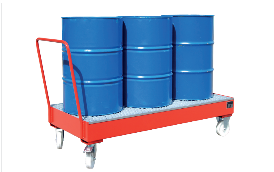
S 2050 SR