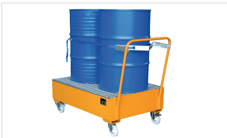
S 2020 with fixture and tension belt (accessories)