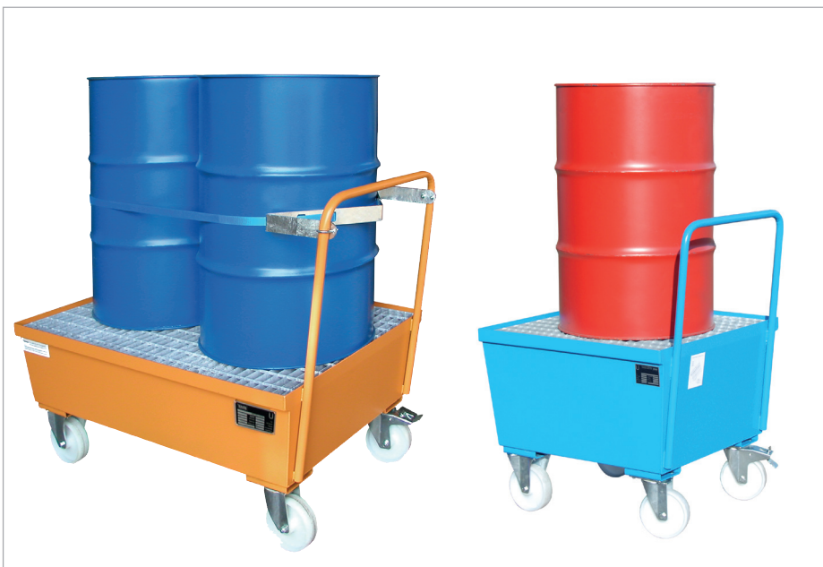
AW-F 2 with fixture and tension belt