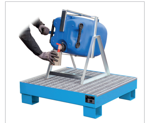
AW 60-2/M with Tilting Canister Stand KAH-60 (see page 116)