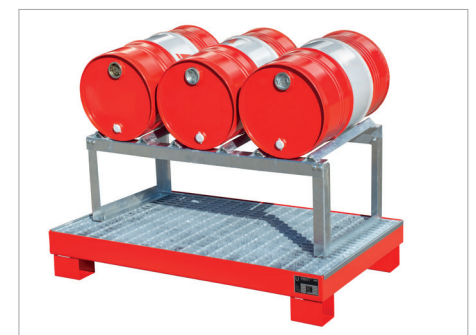
AW 60-3/M with Drum Support FA 60-3 (see page 116)